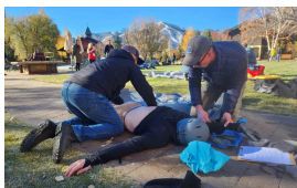
Saint Alphonsus Ski and Trauma Attendees Learn Backcountry Rescue and of Childhood Dangers