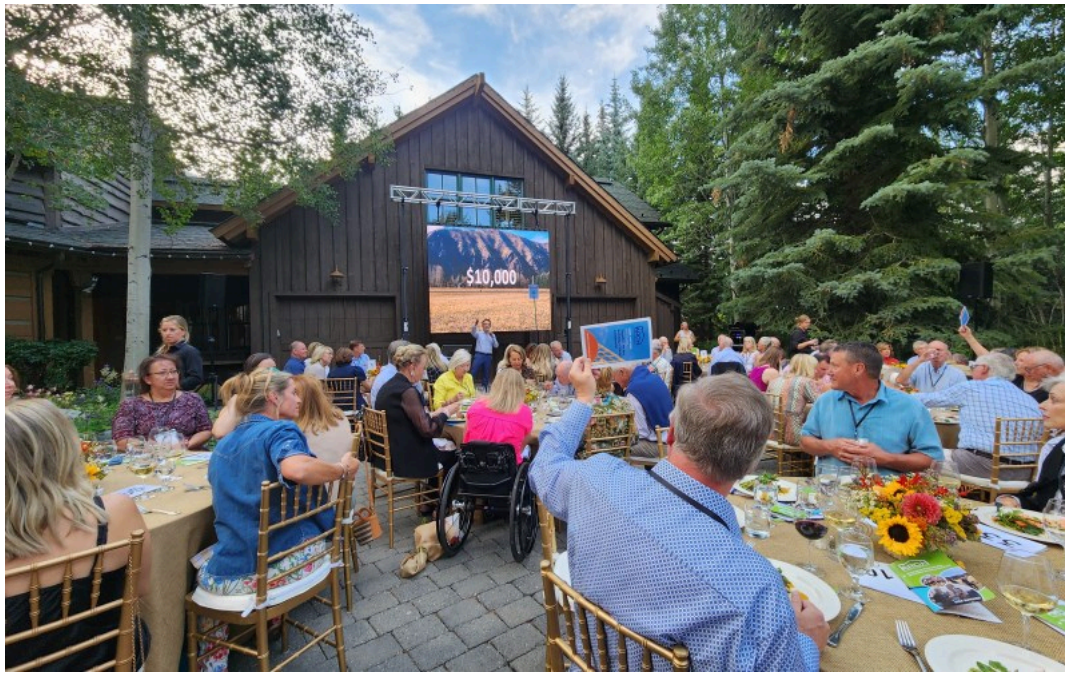
Guests began their paddle raises at $100,000 and worked their way down.

And it's building 19 apartments and cottage on the estate of the century-old Ellsworth Inn in a partnership with the City of Sun Valley, which bought the estate for $2.3 million.