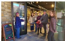
Johnny Was Sports California Cool