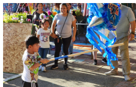
Alliance of Idaho Receives Match Challenge to Help with Immigration Questions